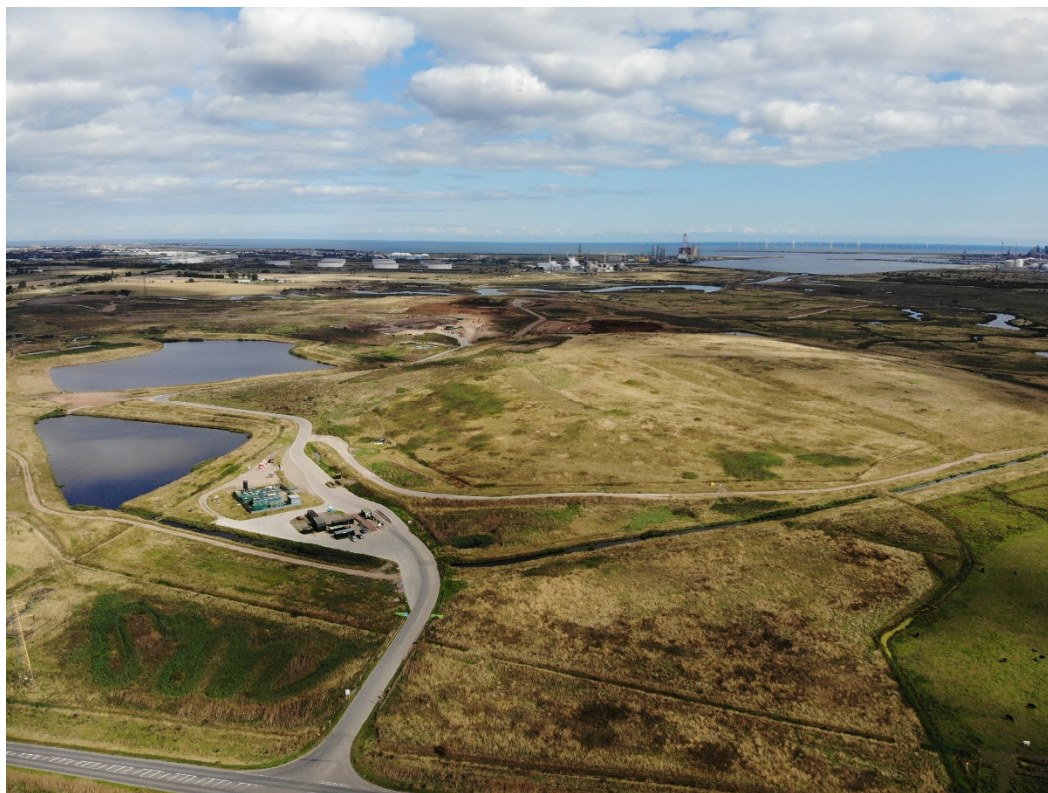
Cowpen Bewley Landfill Site

Cowpen Bewley Landfill is an existing operational landfill site operated by Highfield Environmental. Currently the site operates under Planning Permission (13/2838/EIS) granted by Stockton-on-Tees Borough Council on 14 March 2014 which allows the permit of an integrated restoration project incorporating reprofiling of consented landfill, extraction of clay and creation of water bodies and wildlife habitats.